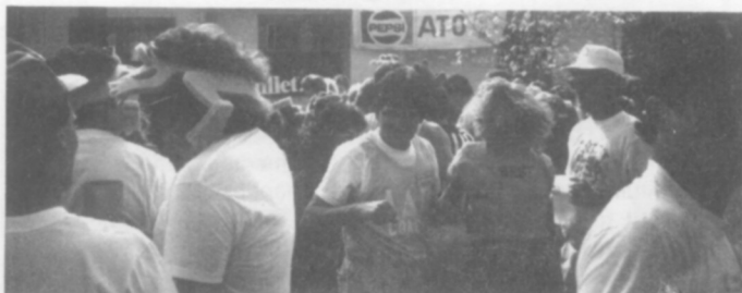
SCENES, FROG HOP 1987