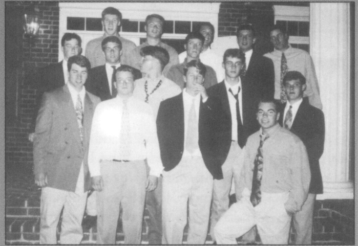
Having accepted their bids, the Beta Chi pledge class is all smiles. They might not be this close to the front door for a while.