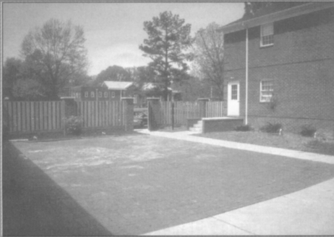
The completed brick court yard between the main Chapter house and the Carriage house.