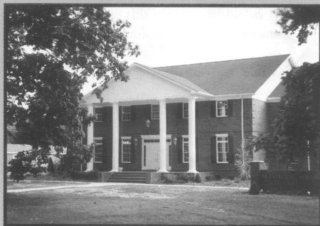
We hope that you have had the opportunity to visit the Chapter House since its completion. If not this view is from the corner of 16th and Main looking Southeast.