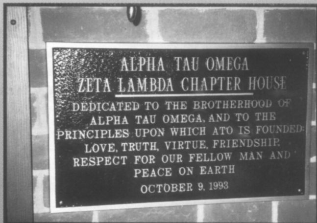
This Bronze dedication plaque was unveiled during the ceremonies of Homecoming. The plaque is adjacent to the front doors of the Chapter House.