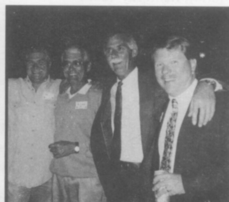
— Random photos of 1995 Homecoming. —