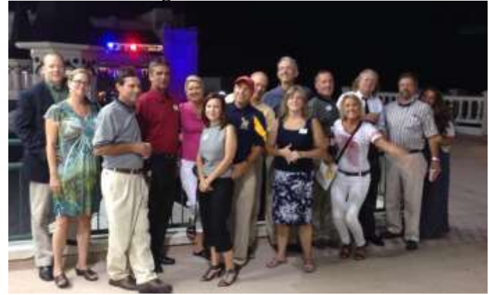
Churchill Downs ATΩ Gathering

Can't make Homecoming or other events? Alumni are having informal gatherings in different cities. In Louisville Fall 2014 AT \Omega 's from different era's gathered at Churchill Downs. The first Tuesday of each month Murray area alumni meet with the Chapter at the Big Apple Café at 5:30pm. There are large Alumni groups in Owensboro, Huntsville, St. Louis, & Nashville Email