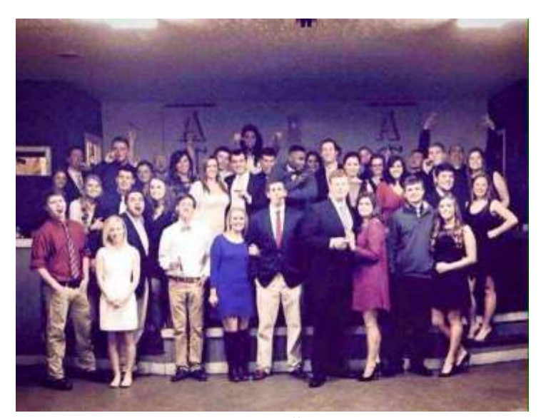
Fall 2015 Smoker