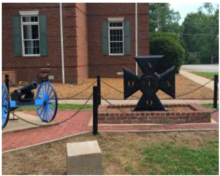
The Memorial and Cannon cleaned, repainted, new bricks donated