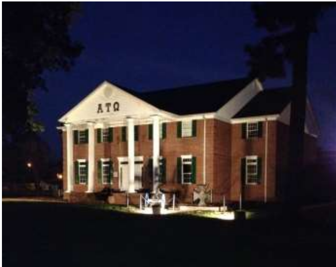
Thanks to Delta Gamma's Jarred Hall for Fixing the Lights